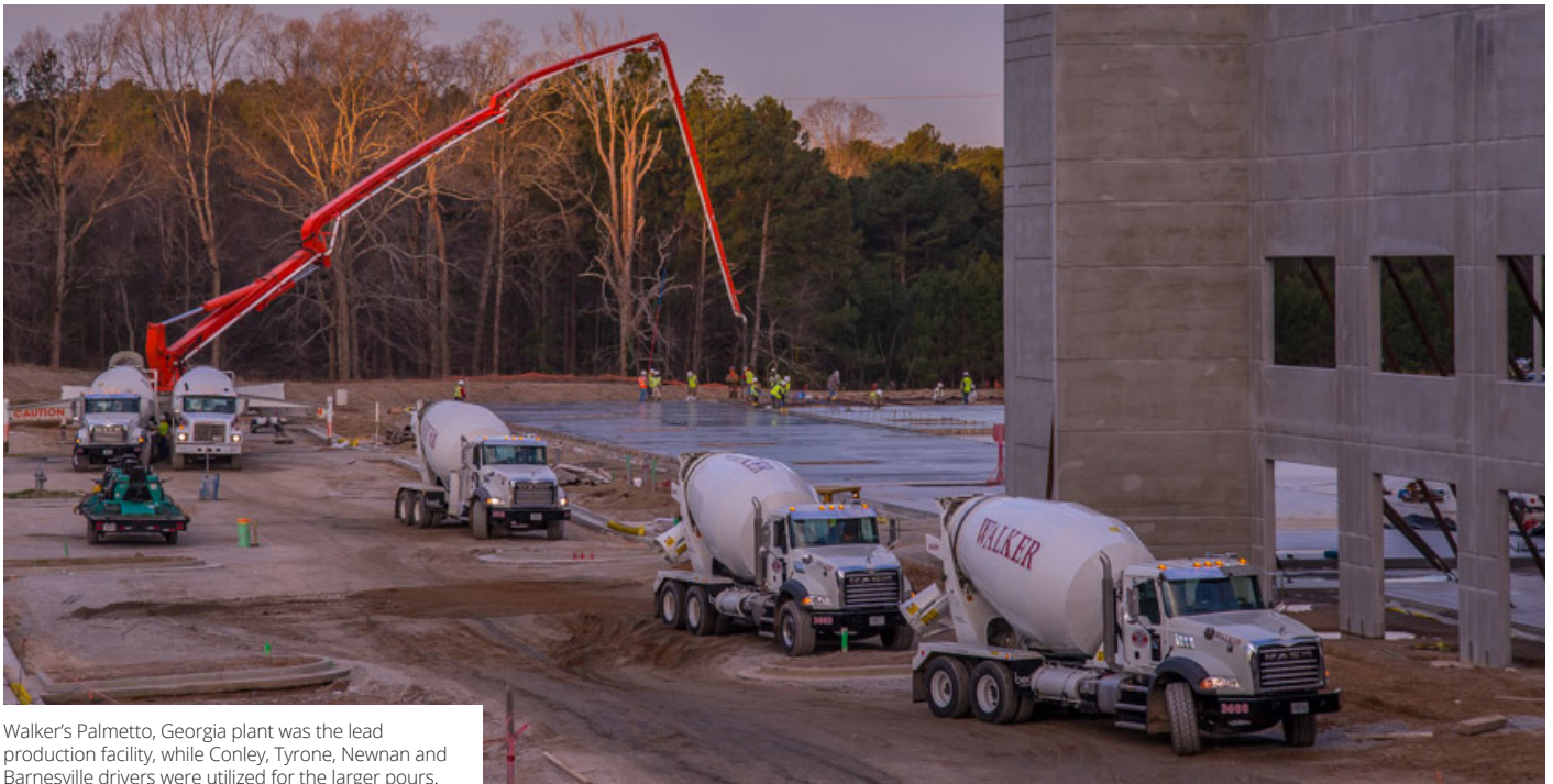
Walker's Palmetto, Georgia plant was the lead production facility, while Conley, Tyrone, Newnan and Barnesville drivers were utilized for the larger pours.