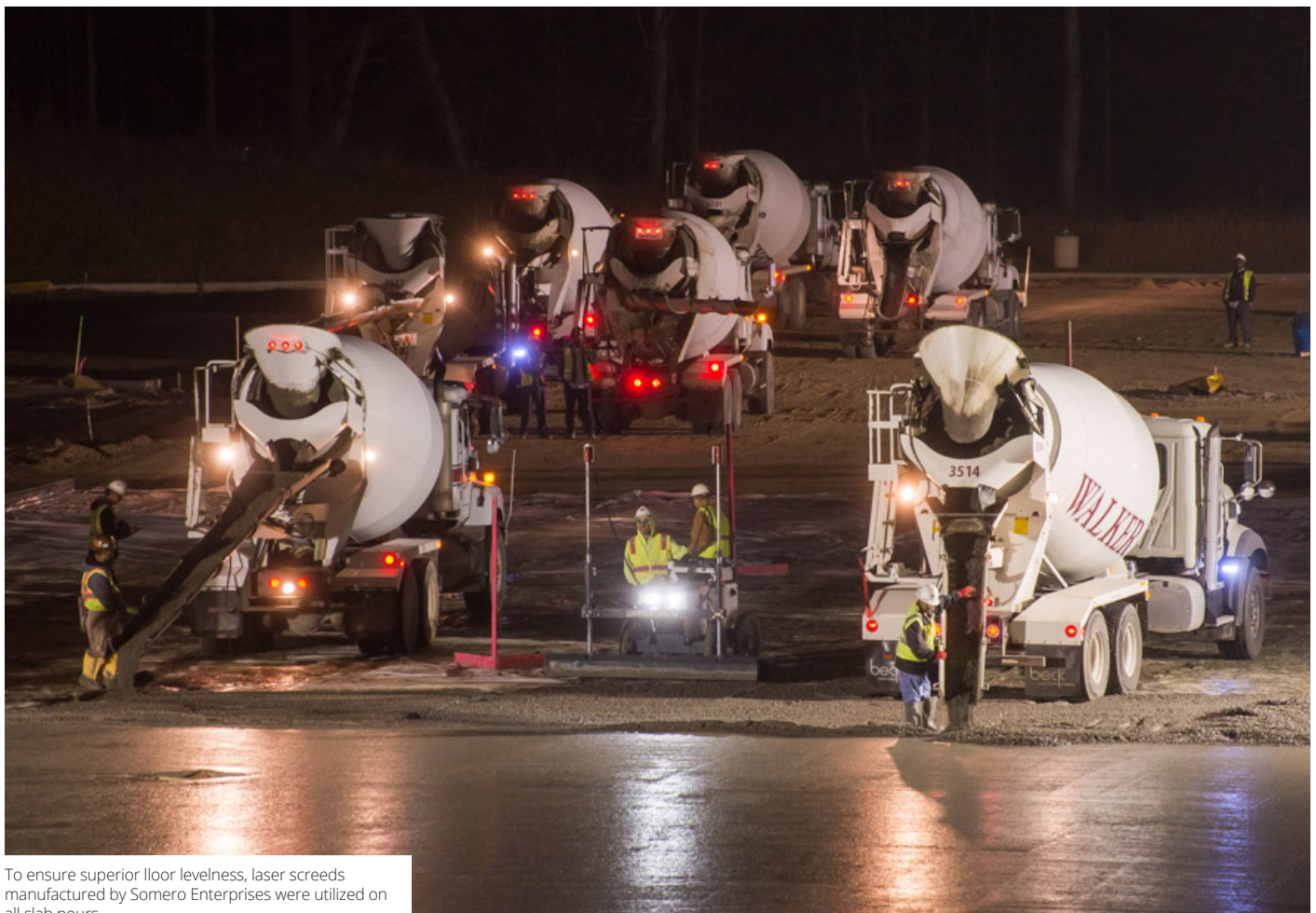
To ensure superior floor levelness, laser screeds manufactured by Somero Enterprises were utilized on all slab pours.

Later in 2016, Walker Concrete is scheduled to work with the contractor on a new 20,000-square-foot warehouse project that will also incorporate Ductilcrete.