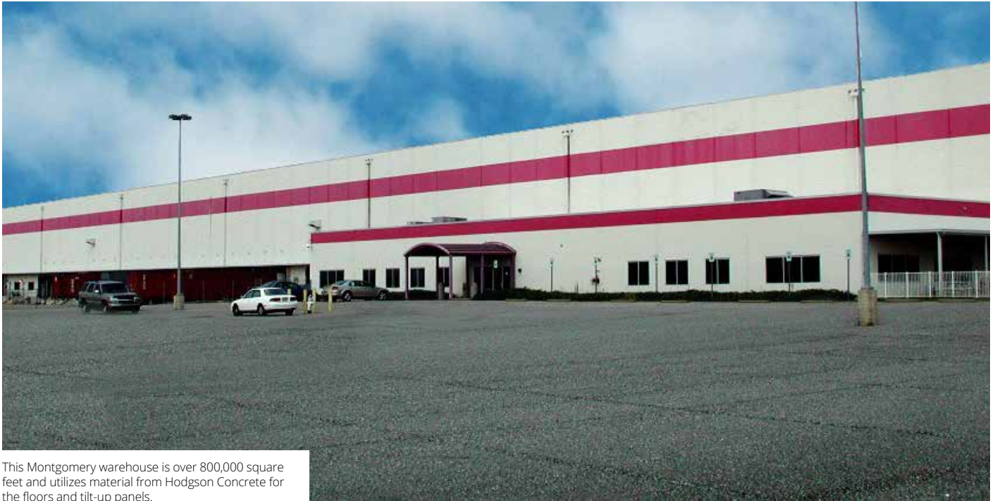
This Montgomery warehouse is over 800,000 square feet and utilizes material from Hodgson Concrete for the floors and tilt-up panels.