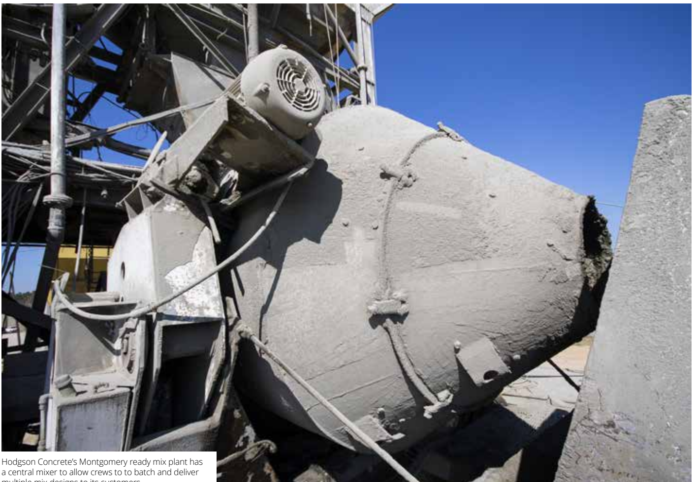
Hodgson Concrete's Montgomery ready mix plant has a central mixer to allow crews to batch and deliver multiple mix designs to its customers.

The warehouse, completed in 1999, is over 800-thousand square feet and was originally build as a distribution point for KB Toys.